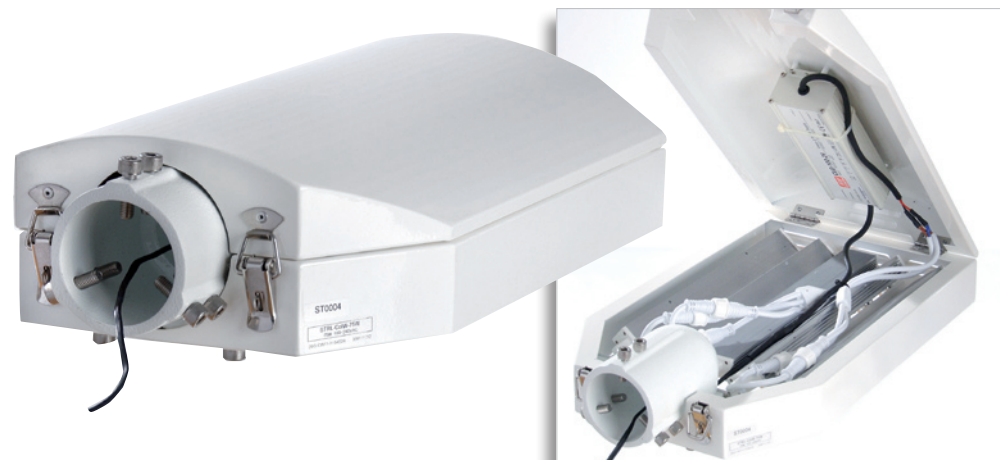
STREET 02 ■ Stainless Steel SUS430, powder-coated. Electrification provided by the customer. 48 cm x 28 cm x 11 cm