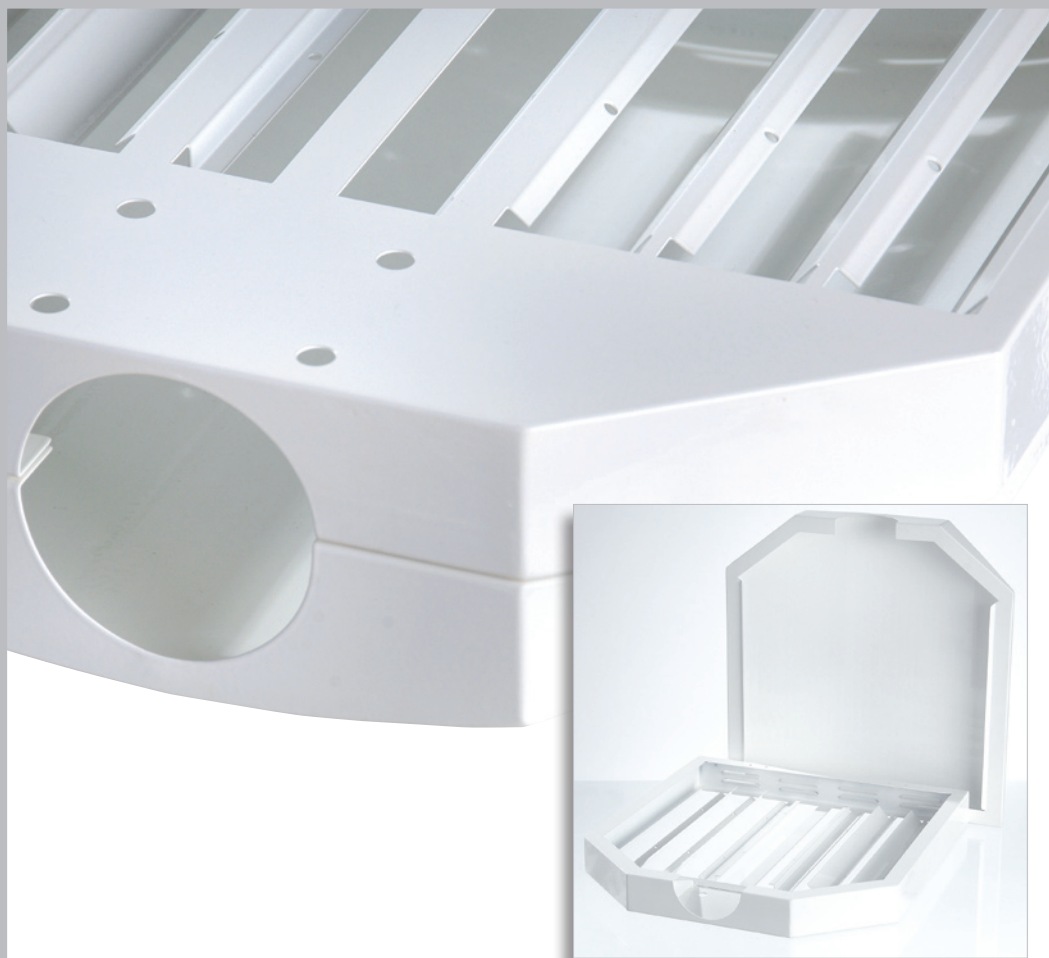
STREET 01 ■ Stainless Steel SUS430, powder-coated. 43 cm x 42 cm x 11 cm